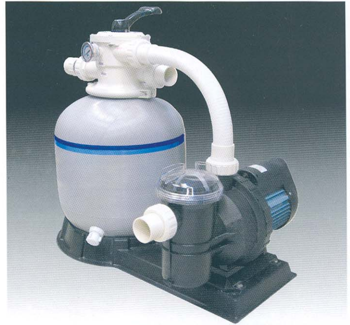
"FS" Series Filtration System

Mega Filtration Systems are the most recommendable equipment for the application of swimming pool and fish pool.